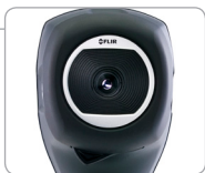
Focus-free Lens for Point-and-Shoot Simplicity