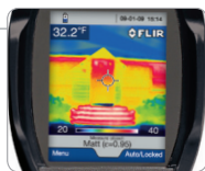
Excellent 2.8" Color LCD Shows the Whole Scene