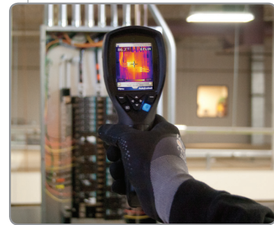
Find Hot Spots Fast!